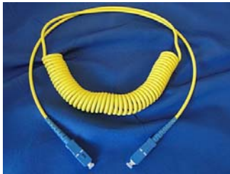
9/125 Singlemode SC to SC Simplex Coiled Fiber Cable

JEM Cable & Fiber is now offering Coiled Fiber Optic Cables. The Coiled Fiber Optic Cables are constructed with robust GGP (Glass/Glass/Polymer) fiber inside, allowing flexible length extension without affecting any optical characteristics. The Coiled Fiber Optic Cables are the ultimate solution for any application requiring a fiber cable with an extensive elastic range.